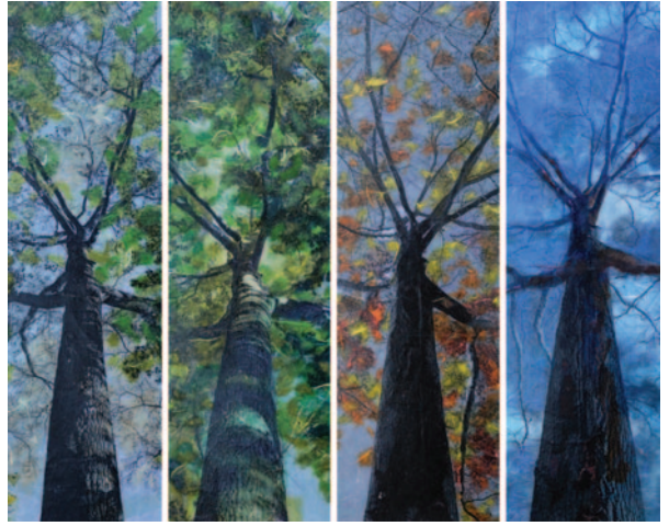
Spring, Summer, Fall, Winter, each 8" x 18" Mulberry paper and acrylic collage with photo transfer.

There are almost as many ways to love the Fairfax County Public Library as there are people who use it. Long gone are the days of libraries being primarily hushed rooms filled with endless rows of bookshelves. Of course, the bookshelves are still here, but today's library offers so much more for so many more people. We've introduced the hashtag #loveyourlibrary to highlight some of the less-traditional ways that Fairfax County residents are enjoying FCPL's services—and how the generosity and support of people like you make it possible.